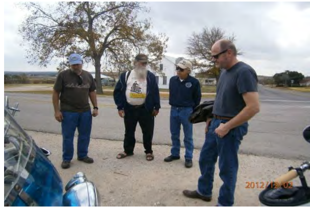
Another Philosophy Session