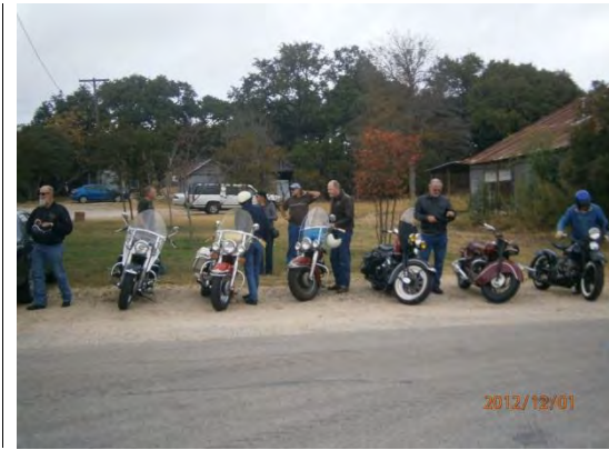
I think we lost the cop's?