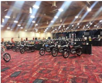
Mid- America Viewing Room

Auction results are online. www.midamericauctions.com and www.bonhams.com/auctions