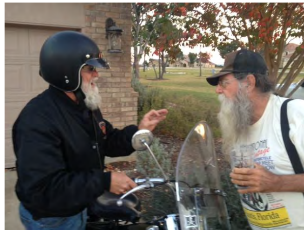
What kind of conditioner do you use?