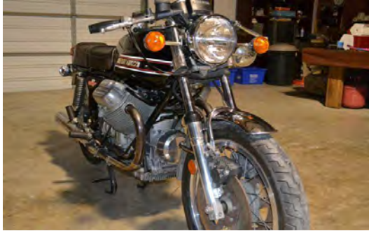
1974 MotoGuzzi V-7 Sport - All Original, 8,200 Miles