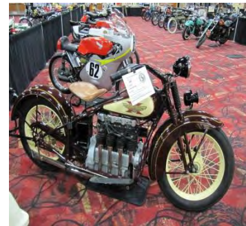
Row after Row of Rare