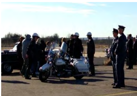
On the Set of JFK movie Parkland