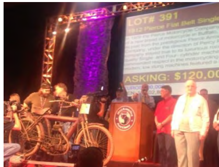
1912 Pierce (Sold $147,500.)