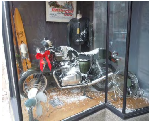
The Isle of Man Shop Window