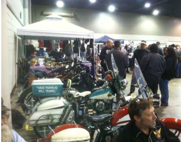
The Cherokee Chapter Booth – Dallas Swap Meet