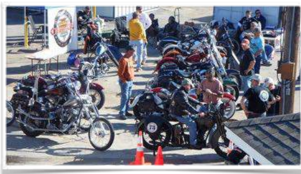
Cherokee Members at RatRod Round Up