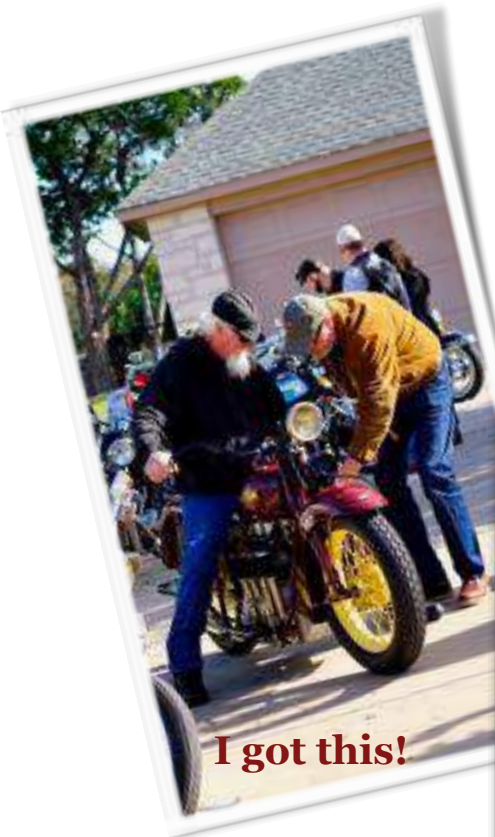
I got this!