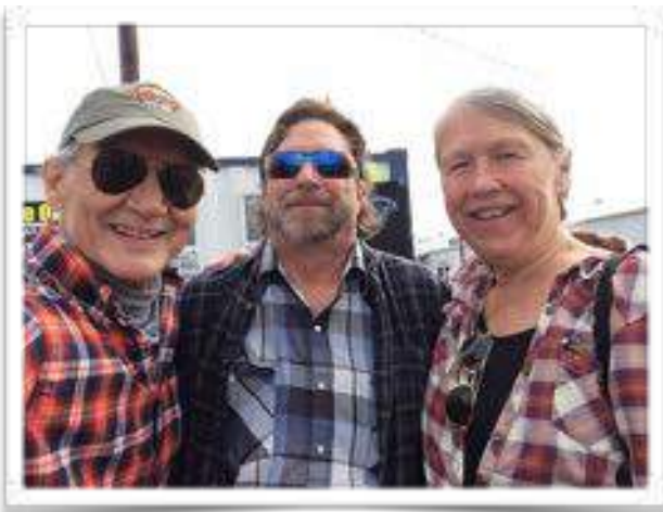
Its Hip to be Plaid!