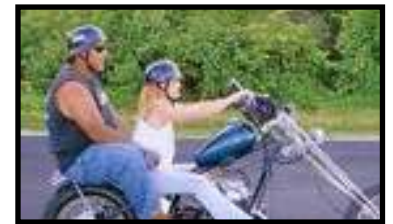
FALL ROAD RUN