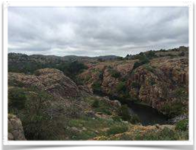
Oklahoma Road Run Views