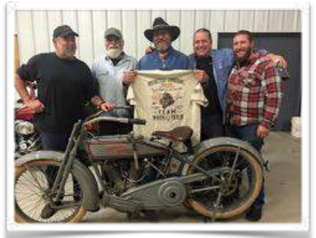
Team White Trash