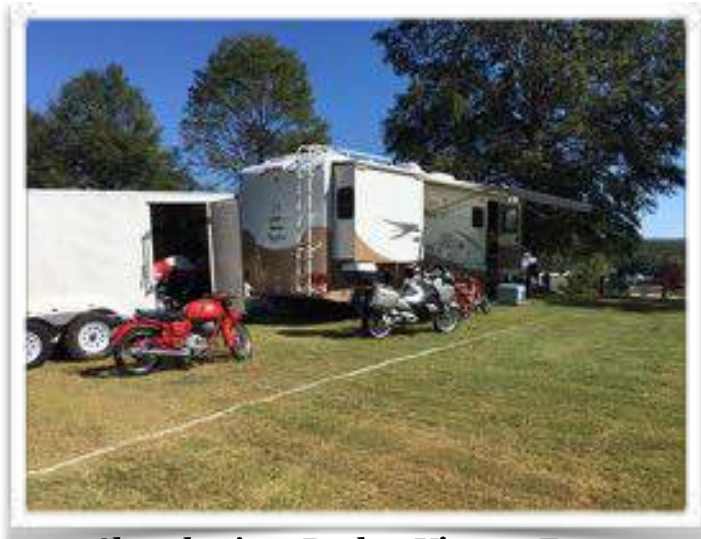
Cherokee's at Barber Vintage Fest