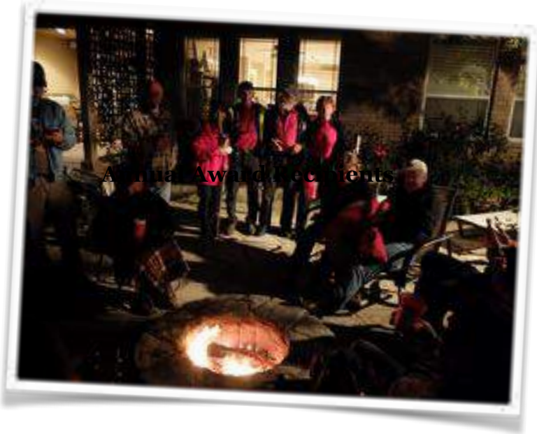
Annual Award Presentations

A few photos of last years Cherokee Christmas Party and Annual Meeting