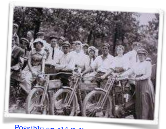
Possibly an old Callen family picture?