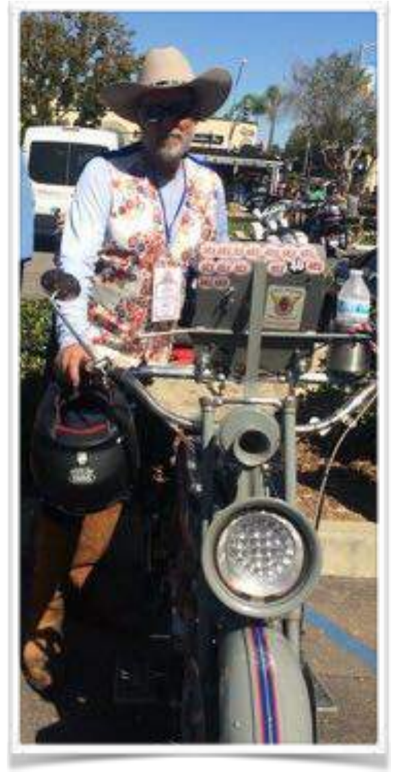
Cherokee Members on the Cannonball