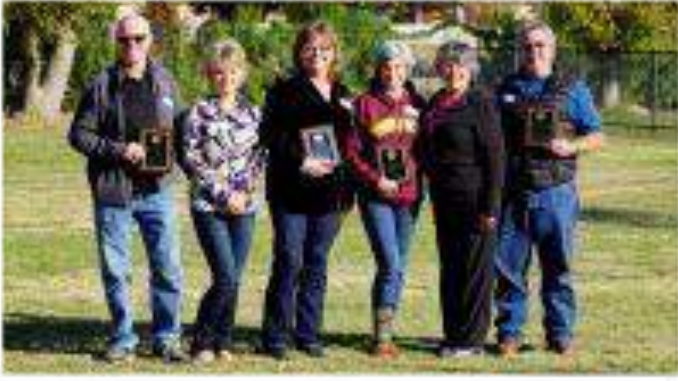
Annual Meeting Cherokee Award Recipients