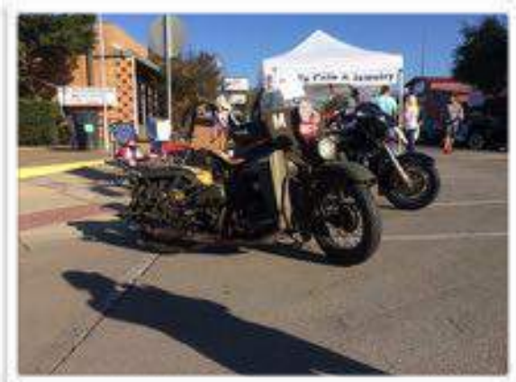
Cherokee Members in Bastrop TX Show