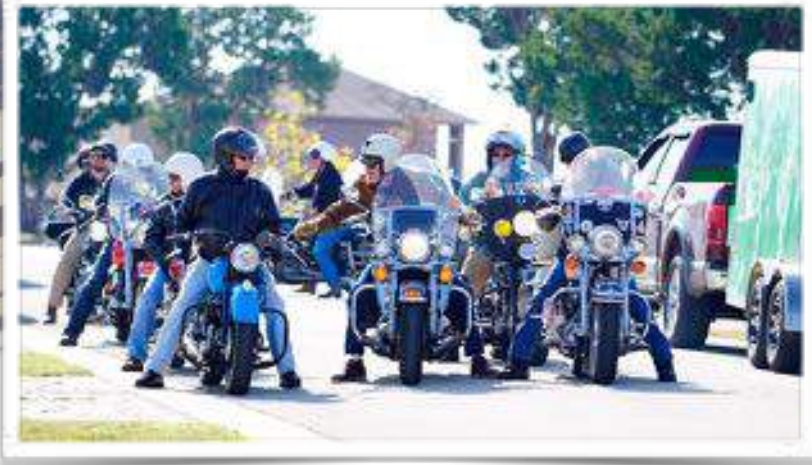
Saturday Morning Ride