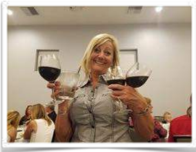
Cannonball Rehydration with Lady T