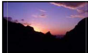
CHEROKEE WE RIDE