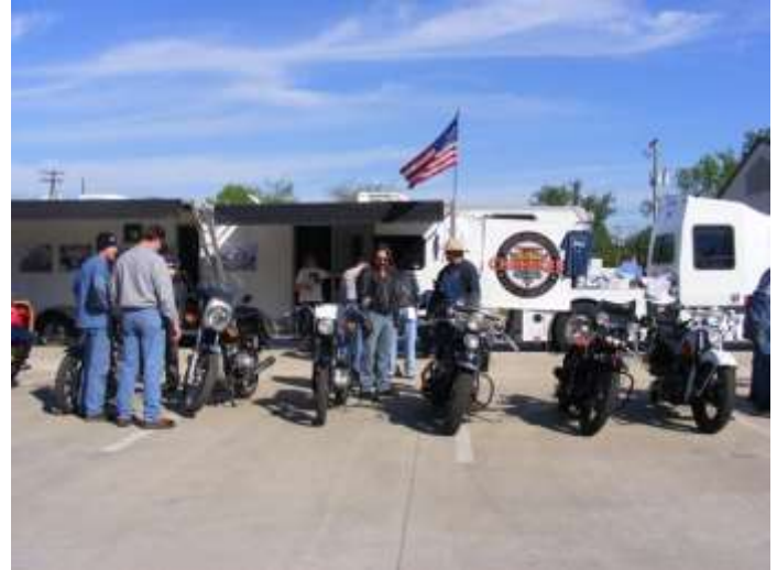
Our First Cherokee Chapter Jefferson TX Road Run.