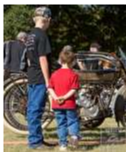
If we could read young minds?