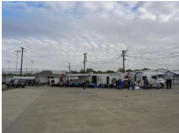
Setting up at the first Cherokee Pistons and Paint Event, Denton TX