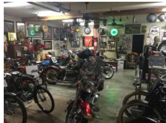
Open shop enjoyed by all!