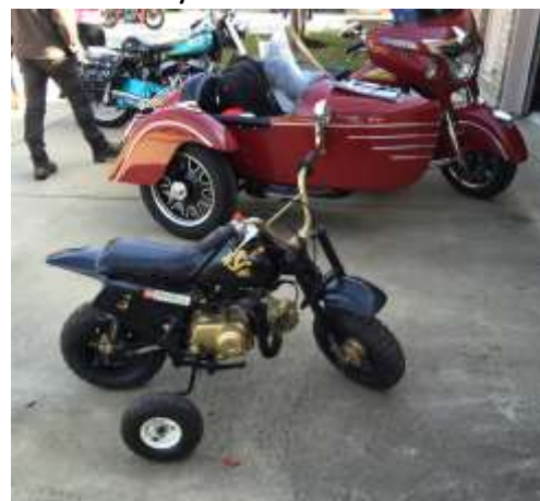
Hmm.... Both rides have extra wheels!