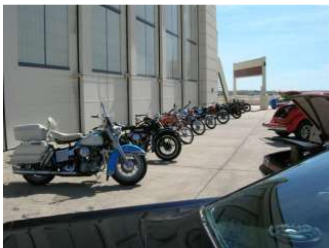
Cherokee Chapter and Jay Leno supporting Our Troops!