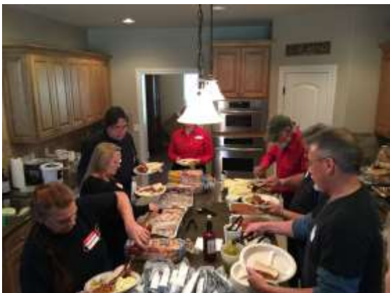
An Annual Cherokee Tradition