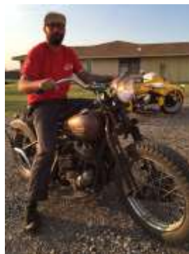
Bobbers and Choppers