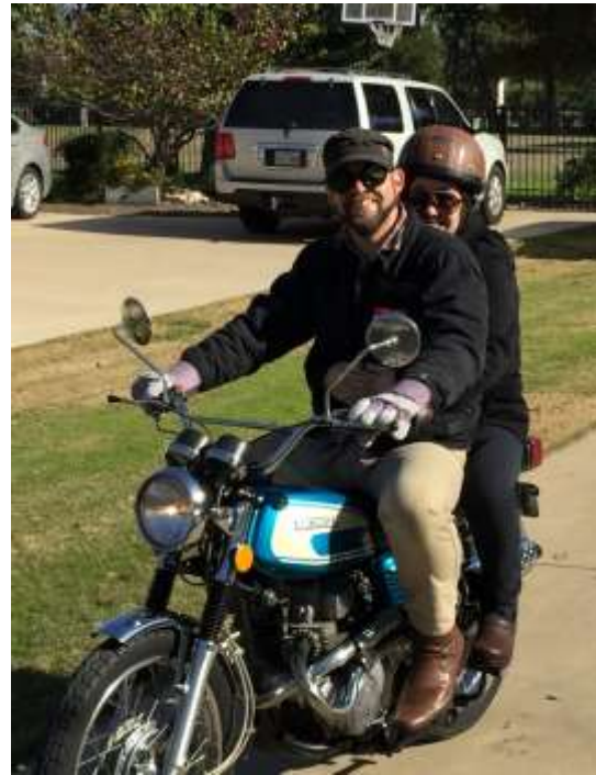
"Geetar Pickers and Riders!"