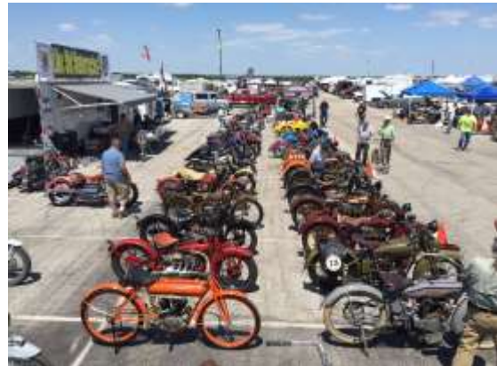
Over 180 Classic Motorcycles on Display in 2015