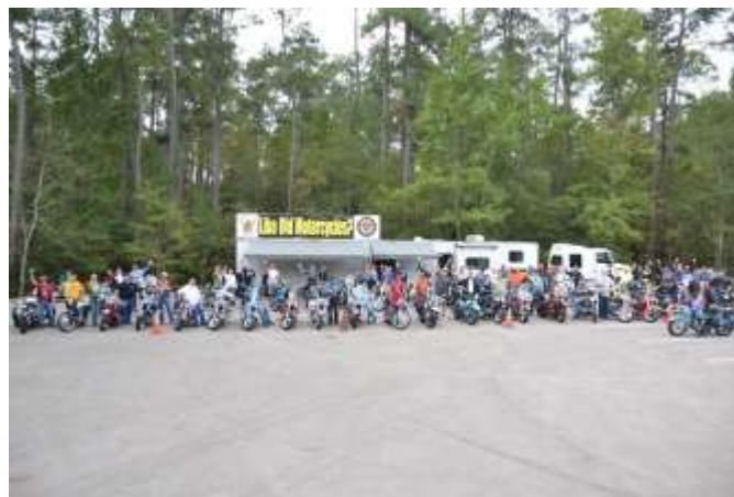
The 2015 Carson Classic Cherokee / Confederate Road Run "Two Great AMCA Chapters Unite for One Awesome Event!"