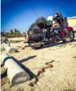
A Texas Speed Bump!

Our Members are our Greatest Asset! It has been a while since we shared older pictures of our past. Plus we have found about 30 years of Chapter History recently in scrapbooks and photo albums that we will share in future newsletters! Please enjoy a few memories here!