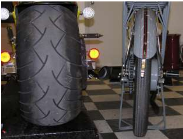
Things have certainly changed in 100 years!