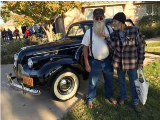
What kind of conditioner do you use?