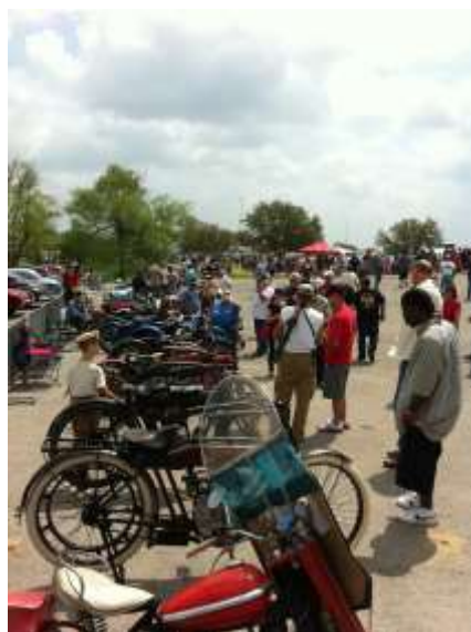
The Lone Star Roundup Austin TX