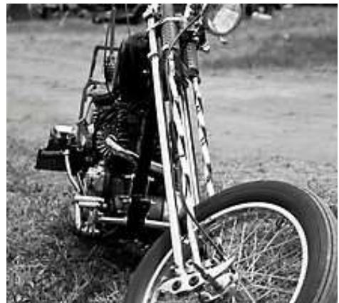
Been a while since we all rode these?