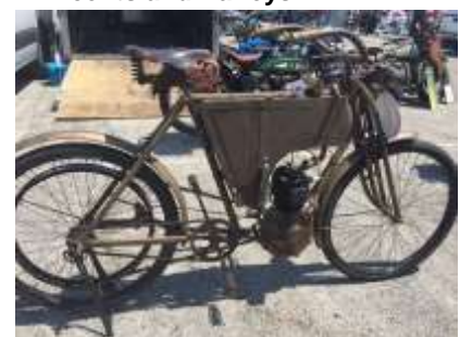
A 1903 Rex... A True Survivor!