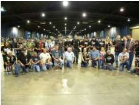
All our Members and all our Trophies!