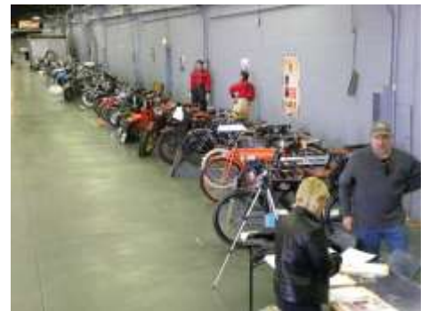
Over 200 feet of our Vintage Motorcycles