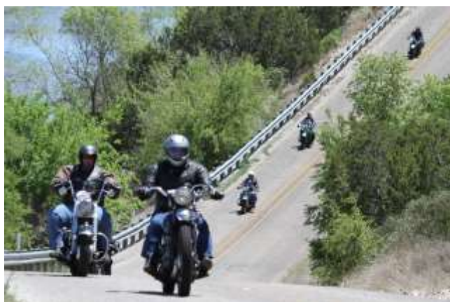
Texas National Road Run, Kerrville TX