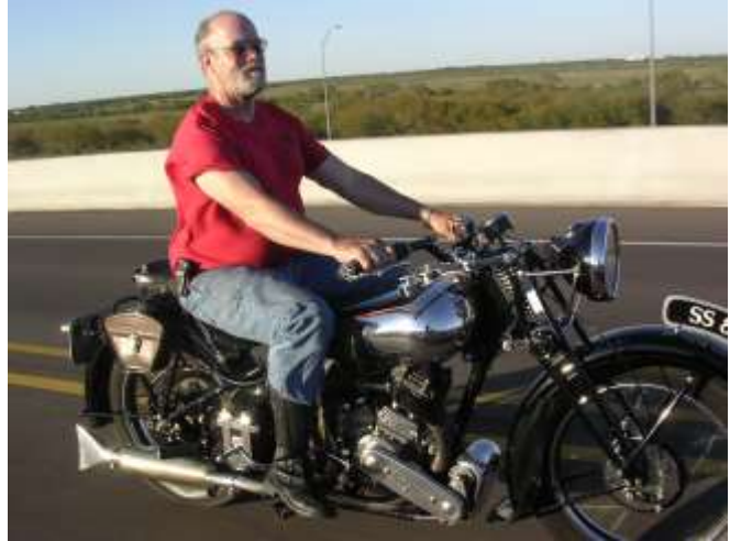
Ride like Royalty - "Bringing It!"