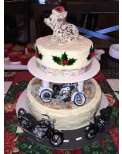
Another Rosie Sterling Creation!