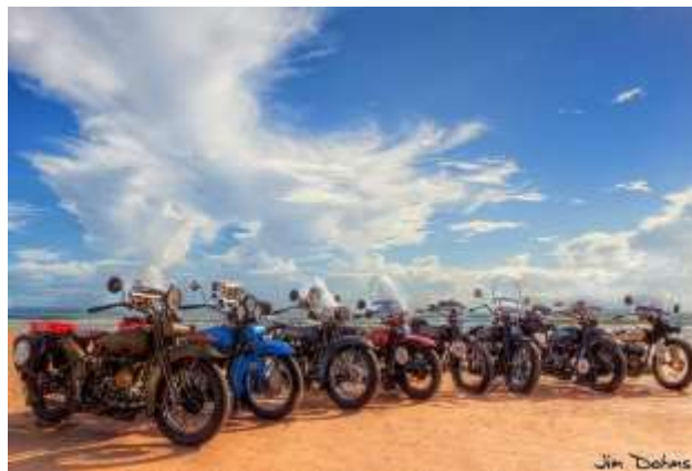
Our Cherokee Members participate in the Cannonball Coast to Coast Endurance Race every two years!