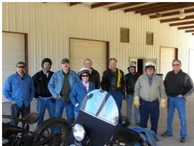
A typical Smithville Sunday Morning for many years!