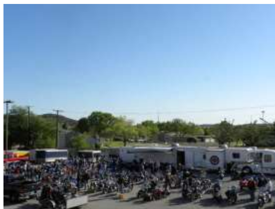
Another Texas National Road Run in Kerrville TX