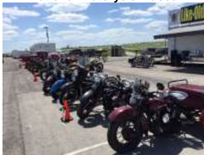
The 40's row All classes were by decade in 2015