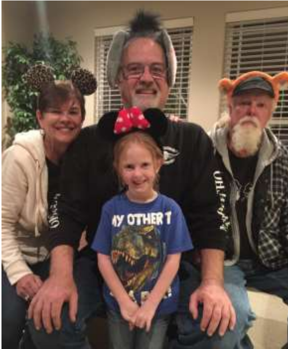
I get to be Dumbo again! Cherokee Fun for all ages!