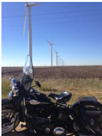
At a Sweetwater TX Road Run