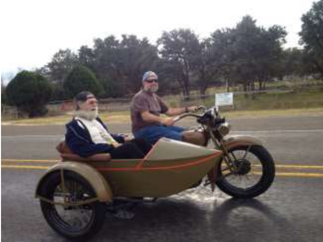
Santa Claus lives in Texas in the summer and rides a HD!