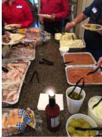
No one ever goes hungry here!