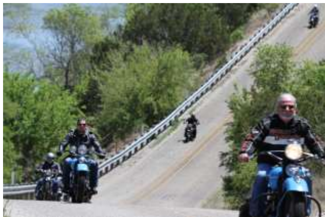
Members participate in Cherokee and National Road Runs

“Please take time to fill out this important Member Survey when it arrives in your mailbox so we know how you feel, know what is most important to you, know what your preferences are in running the Cherokee Chapter as we move forward in 2016!”