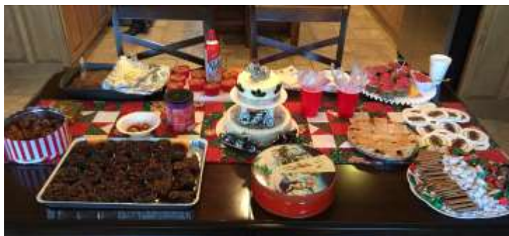
The Dessert Table