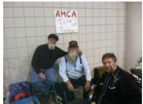
The First Ever Cherokee Reach-Out Team (Notice our expensive sign!)