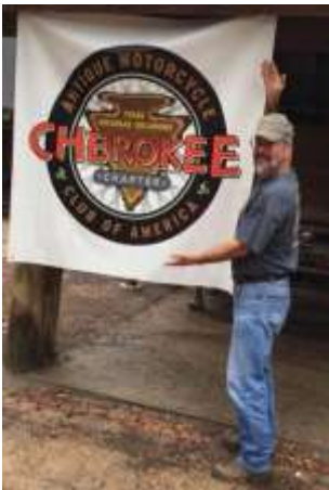
"Kind of says it all!"