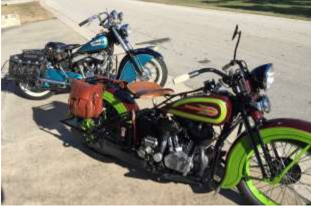
More Butch Hudkins Beauties