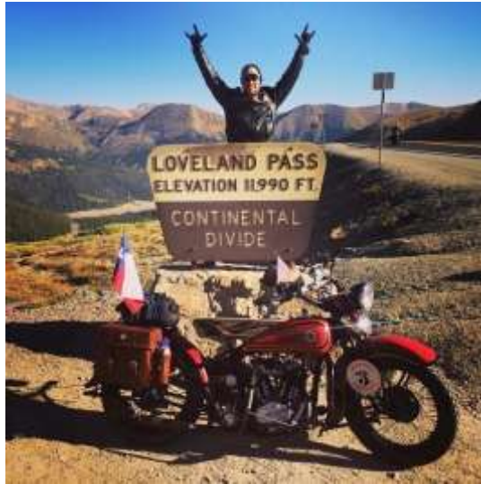
Buck Carson is high again!