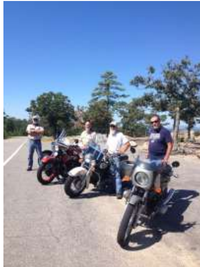
Members ride in Hot Springs AR