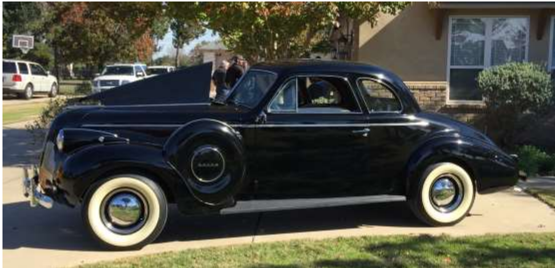
What the ? A 1937 Buick Coupe arrived at the Cherokee Chapter Christmas Party / Annual Meeting!