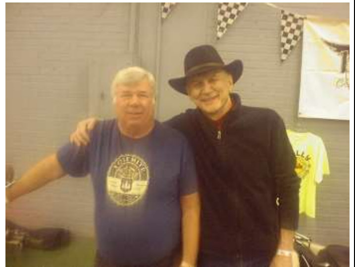
Our First Oklahoma Members. Great Men & Great Friends