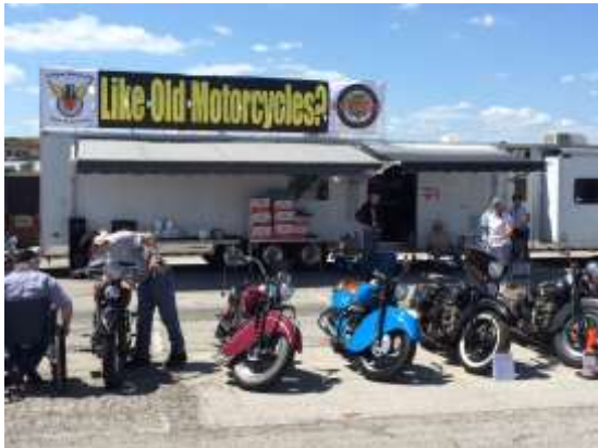
Cherokee Chapter Command Central during Pate