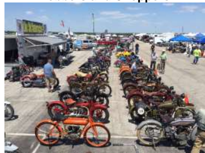
This row actually stretched three blocks to the far rear of this photo!