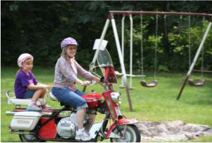
Ladies do ride in the Cherokee Chapter!