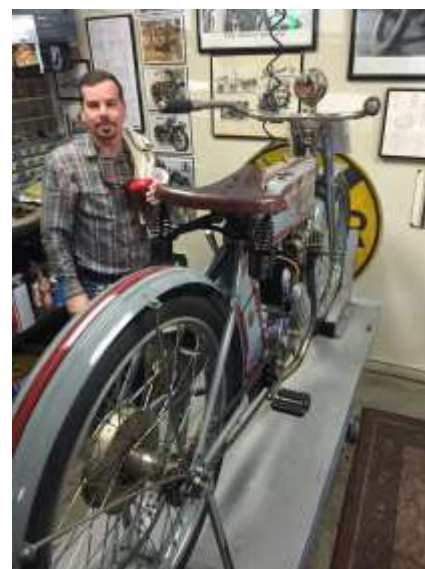
Getting mentally ready for Cannonball 2016