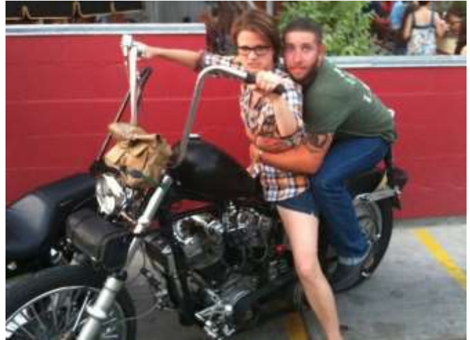
Clowning around caused a wedding...then a baby ... and they lived Happily Ever After!