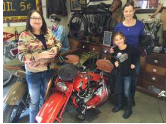
We caught these Cherokee ladies in the shop?