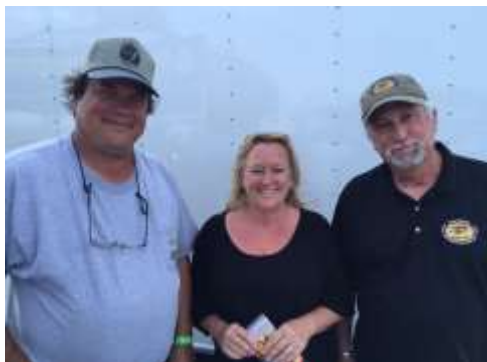
National Motorcycle Museum Award