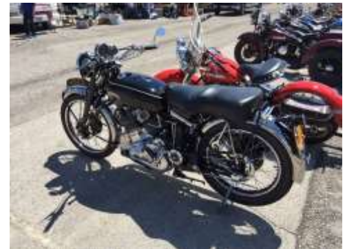
Vincents and Harleys